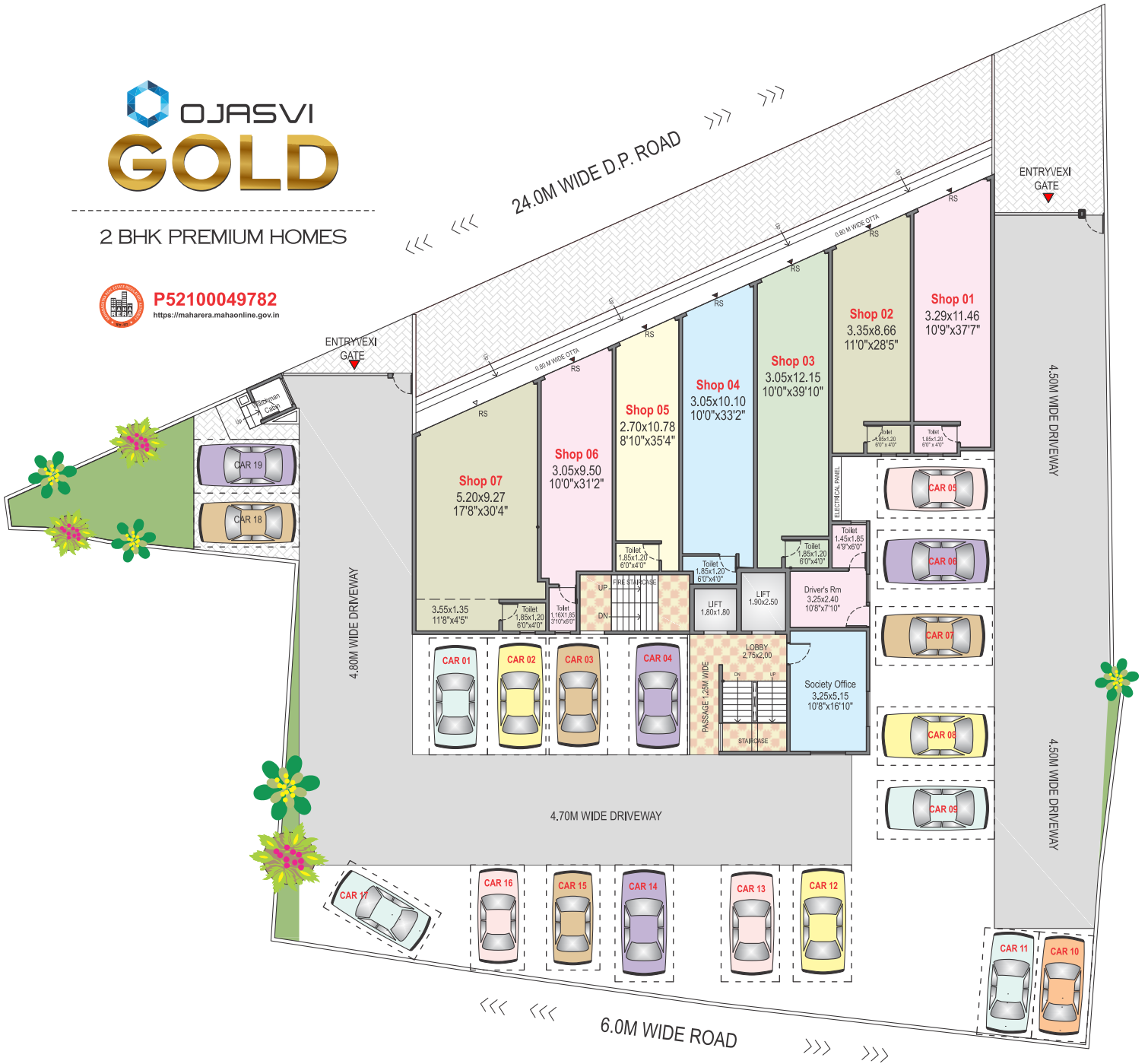
Carpet in sq.m.

P52100049782 https://maharera.mahaonline.gov.in